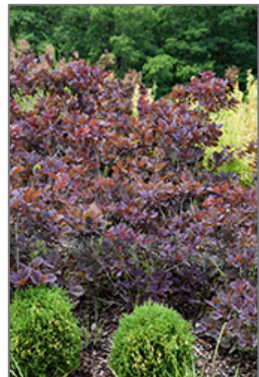
Velveteeny Purple Smokebush