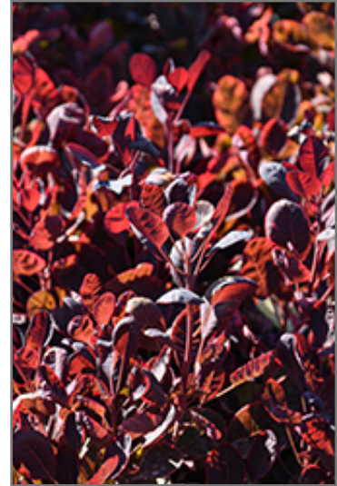
Velveteeny Purple Smokebush foliage

Velveteeny Purple Smokebush makes a fine choice for the outdoor landscape, but it is also well-suited for use in outdoor pots and containers. With its upright habit of growth, it is best suited for use as a 'thriller' in the 'spiller-thriller-filler' container combination; plant it near the center of the pot, surrounded by smaller plants and those that spill over the edges. It is even sizeable enough that it can be grown alone in a suitable container. Note that when grown in a container, it may not perform exactly as indicated on the tag - this is to be expected. Also note that when growing plants in outdoor containers and baskets, they may require more frequent waterings than they would in the yard or garden. Be aware that in our climate, most plants cannot be expected to survive the winter if left in containers outdoors, and this plant is no exception. Contact our experts for more information on how to protect it over the winter months.