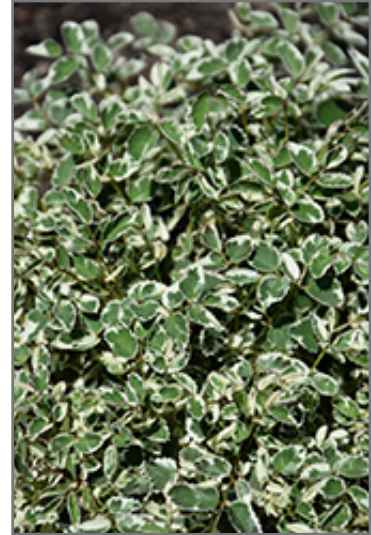
Little Angel Burnet flowers

Little Angel Burnet will grow to be only 4 inches tall at maturity extending to 10 inches tall with the flowers, with a spread of 14 inches. When grown in masses or used as a bedding plant, individual plants should be spaced approximately 12 inches apart. It grows at a medium rate, and under ideal conditions can be expected to live for approximately 15 years. As an herbaceous perennial, this plant will usually die back to the crown each winter, and will regrow from the base each spring. Be careful not to disturb the crown in late winter when it may not be readily seen!