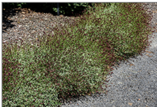
Little Angel Burnet in bloom