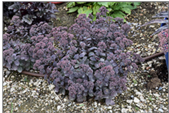
Rock 'N Grow Superstar Stonecrop in bloom