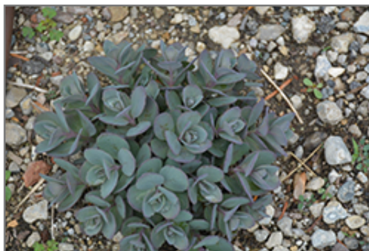
Rock 'N Grow Superstar Stonecrop