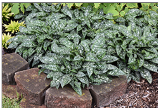
Twinkle Toes Lungwort

Twinkle Toes Lungwort will grow to be about 12 inches tall at maturity, with a spread of 18 inches. When grown in masses or used as a bedding plant, individual plants should be spaced approximately 15 inches apart. Its foliage tends to remain dense right to the ground, not requiring facer plants in front. It grows at a medium rate, and under ideal conditions can be expected to live for approximately 10 years. As an herbaceous perennial, this plant will usually die back to the crown each winter, and will regrow from the base each spring. Be careful not to disturb the crown in late winter when it may not be readily seen!