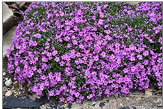
Rocky Road Pink Phlox in bloom