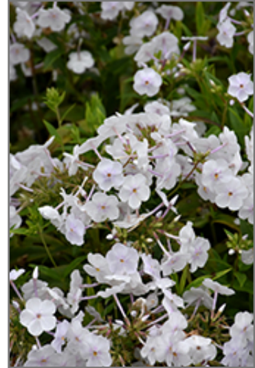
Fashionably Early Crystal Garden Phlox flowers