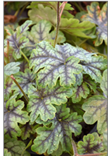
Tapestry Foamy Bells foliage