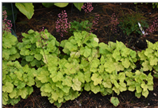
Primo Pretty Pistachio Coral Bells

Primo Pretty Pistachio Coral Bells will grow to be about 10 inches tall at maturity extending to 22 inches tall with the flowers, with a spread of 28 inches. When grown in masses or used as a bedding plant, individual plants should be spaced approximately 26 inches apart. Its foliage tends to remain low and dense right to the ground. It grows at a medium rate, and under ideal conditions can be expected to live for approximately 10 years. As an evergreen perennial, this plant will typically keep its form and foliage year-round.