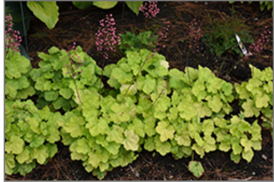
Primo Pretty Pistachio Coral Bells

Primo Pretty Pistachio Coral Bells will grow to be about 10 inches tall at maturity extending to 22 inches tall with the flowers, with a spread of 28 inches. When grown in masses or used as a bedding plant, individual plants should be spaced approximately 26 inches apart. Its foliage tends to remain low and dense right to the ground. It grows at a medium rate, and under ideal conditions can be expected to live for approximately 10 years.