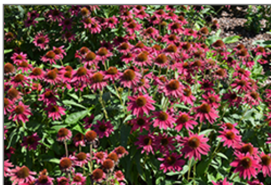
Sombrero Tres Amigos Coneflower in bloom