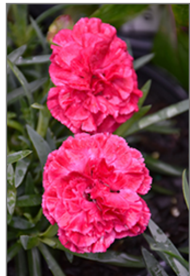
Fruit Punch Raspberry Ruffles Pinks flowers