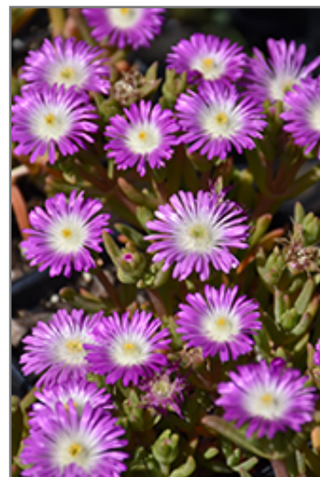
Wheels of Wonder Violet Wonder Ice Plant flowers