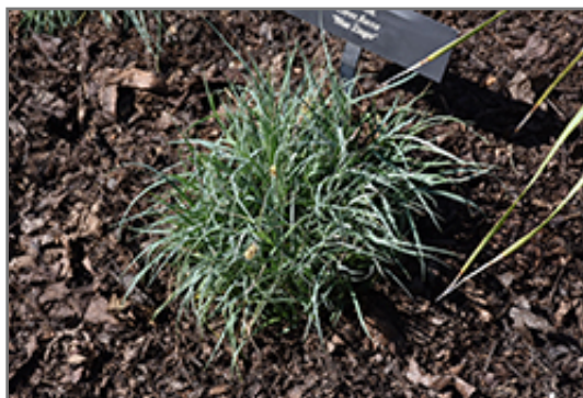
Blue Zinger Blue Sedge