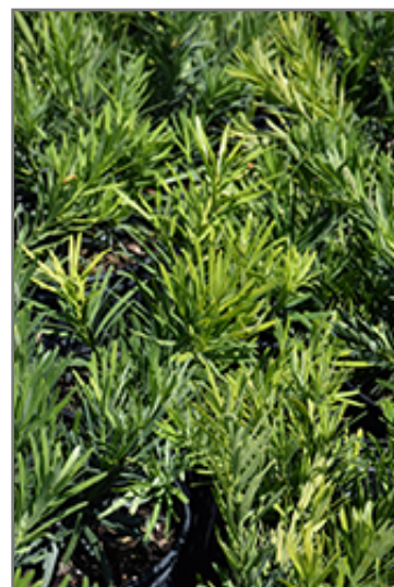
Pringle's Dwarf Shrubby Podocarpus foliage