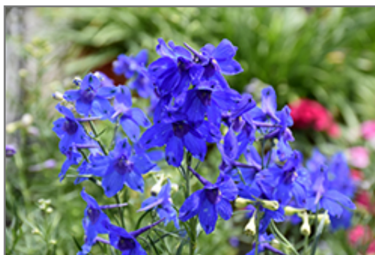
Summer Nights Delphinium flowers