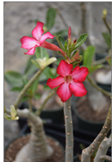
Desert Rose flowers