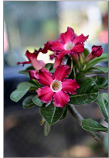
Desert Rose flowers