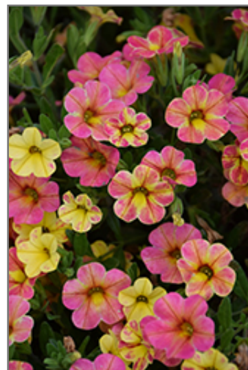
Chameleon Indian Summer Calibrachoa flowers

Chameleon Indian Summer Calibrachoa is a dense herbaceous annual with a trailing habit of growth, eventually spilling over the edges of hanging baskets and containers. Its medium texture blends into the garden, but can always be balanced by a couple of finer or coarser plants for an effective composition.