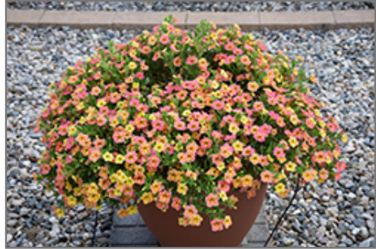
Chameleon Indian Summer Calibrachoa in bloom