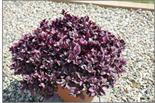
Purple Prince Alternanthera

Purple Prince Alternanthera will grow to be about 14 inches tall at maturity, with a spread of 20 inches. When grown in masses or used as a bedding plant, individual plants should be spaced approximately 14 inches apart. Its foliage tends to remain dense right to the ground, not requiring facer plants in front. Although it's not a true annual, this fast-growing plant can be expected to behave as an annual in our climate if left outdoors over the winter, usually needing replacement the following year. As such, gardeners should take into consideration that it will perform differently than it would in its native habitat.