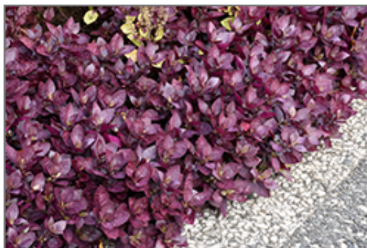
Purple Prince Alternanthera