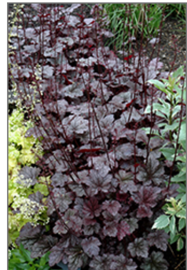
Plum Pudding Coral Bells in bloom