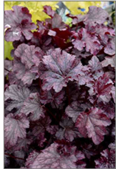
Plum Pudding Coral Bells foliage

Plum Pudding Coral Bells is recommended for the following landscape applications;