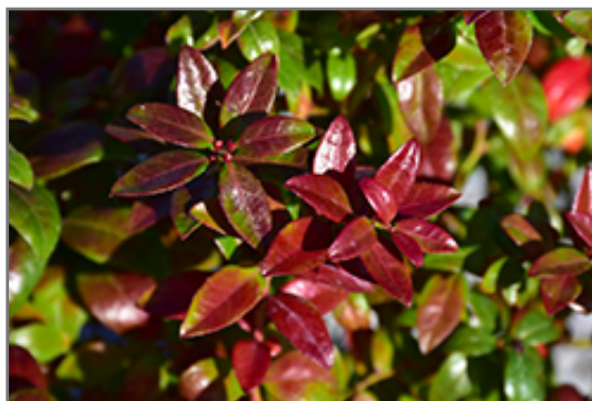
Blueberry Glaze Blueberry in fall