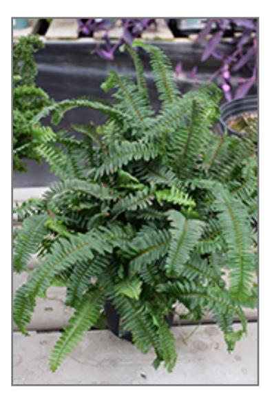
Kimberley Queen Australian Sword Fern in full

When grown indoors, Kimberley Queen Australian Sword Fern can be expected to grow to be about 3 feet tall at maturity, with a spread of 3 feet. It grows at a fast rate, and under ideal conditions can be expected to live for approximately 20 years. This houseplant performs well in both bright or indirect sunlight and strong artificial light, and can therefore be situated in almost any well-lit room or location. It does best in average to evenly moist soil, but will not tolerate standing water. The surface of the soil shouldn't be allowed to dry out completely, and so you should expect to water this plant once and possibly even twice each week. Be aware that your particular watering schedule may vary depending on its location in the room, the pot size, plant size and other conditions; if in doubt, ask one of our experts in the store for advice. It is not particular as to soil pH, but grows best in rich soil. Contact the store for specific recommendations on pre-mixed potting soil for this plant.