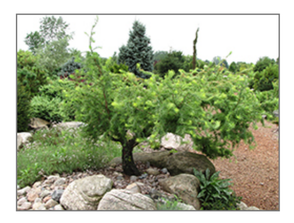
Diana Japanese Larch