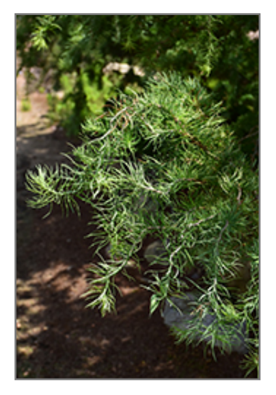
Diana Japanese Larch foliage