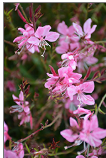
Gaudi Rose Gaura flowers

This is a relatively low maintenance plant, and is best cleaned up in early spring before it resumes active growth for the season. It is a good choice for attracting butterflies to your yard, but is not particularly attractive to deer who tend to leave it alone in favor of tastier treats. It has no significant negative characteristics.