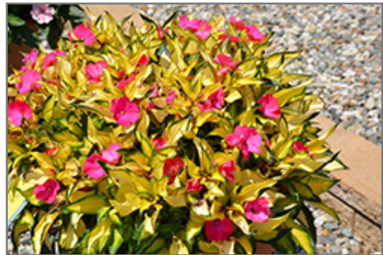
SunPatiens Compact Tropical Rose New Guinea Impatiens in bloom