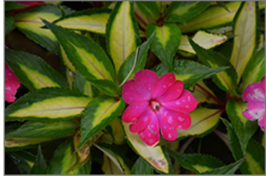
SunPatiens Compact Tropical Rose New Guinea Impatiens flowers