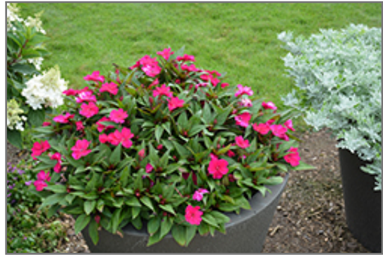
SunPatiens Compact Neon Pink New Guinea Impatiens in bloom

SunPatiens Compact Neon Pink New Guinea Impatiens will grow to be about 24 inches tall at maturity, with a spread of 24 inches. When grown in masses or used as a bedding plant, individual plants should be spaced approximately 20 inches apart. Its foliage tends to remain dense right to the ground, not requiring facer plants in front. This fast-growing annual will normally live for one full growing season, needing replacement the following year.