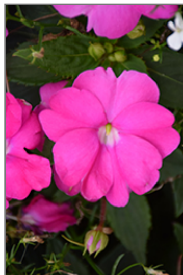
SunPatiens Compact Neon Pink New Guinea Impatiens flowers

This plant will require occasional maintenance and upkeep, and should not require much pruning, except when necessary, such as to remove dieback. It is a good choice for attracting bees and butterflies to your yard. It has no significant negative characteristics.