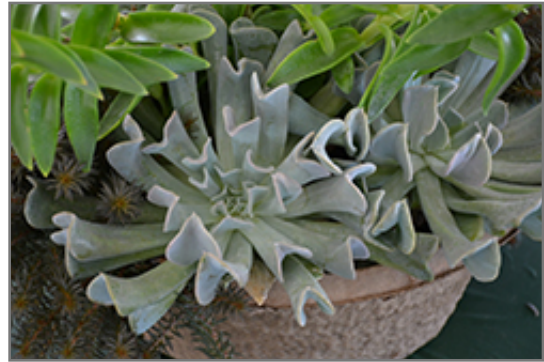
Topsy Turvy Echeveria

This is a dense herbaceous evergreen houseplant with tall flower stalks held atop a low mound of foliage. Its relatively fine texture sets it apart from other indoor plants with less refined foliage. This plant should not require much pruning, except when necessary to keep it looking its best.