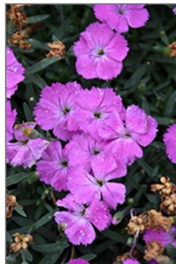
Paint The Town Fuchsia Pinks flowers

This is a relatively low maintenance plant, and is best cleaned up in early spring before it resumes active growth for the season. It is a good choice for attracting bees and butterflies to your yard, but is not particularly attractive to deer who tend to leave it alone in favor of tastier treats. It has no significant negative characteristics.