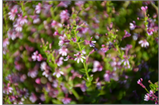
Fairy Dust Pink Cuphea flowers

Fairy Dust Pink Cuphea is recommended for the following landscape applications;