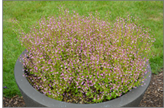
Fairy Dust Pink Cuphea in bloom

Fairy Dust Pink Cuphea will grow to be about 12 inches tall at maturity extending to 16 inches tall with the flowers, with a spread of 15 inches. When grown in masses or used as a bedding plant, individual plants should be spaced approximately 10 inches apart. Its foliage tends to remain dense right to the ground, not requiring facer plants in front. Although it's not a true annual, this plant can be expected to behave as an annual in our climate if left outdoors over the winter, usually needing replacement the following year. As such, gardeners should take into consideration that it will perform differently than it would in its native habitat.