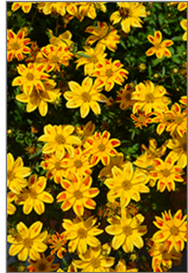
Beedance Red Stripe Bidens flowers

Beedance Red Stripe Bidens is recommended for the following landscape applications;