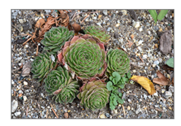
Chick Charms Bing Cherry Hens And Chicks

Chick Charms Bing Cherry Hens And Chicks is recommended for the following landscape applications;