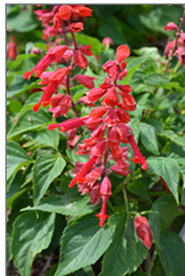
Saucy Red Salvia flowers

Saucy Red Salvia is recommended for the following landscape applications;