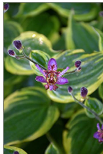
Autumn Glow Toad Lily flowers