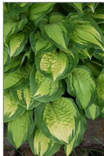
Island Breeze Hosta foliage