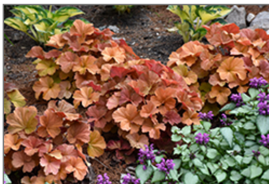
Northern Exposure Amber Coral Bells