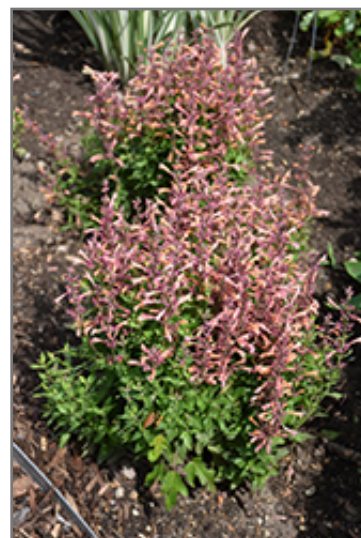
Mango Tango Hyssop in bloom