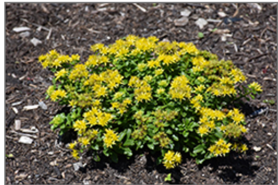
Little Miss Sunshine Stonecrop in bloom