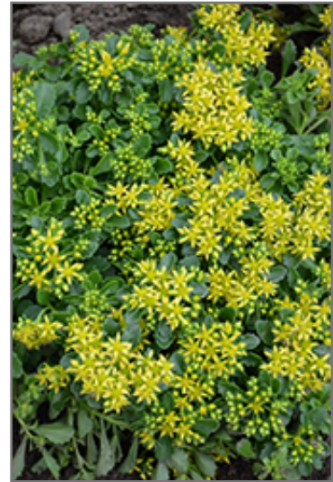
Little Miss Sunshine Stonecrop flowers

Little Miss Sunshine Stonecrop is recommended for the following landscape applications;