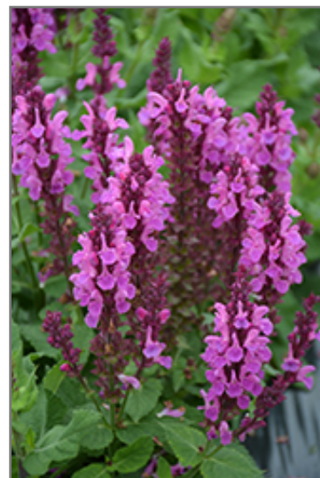
Rose Marvel Meadow Sage flowers

This is a relatively low maintenance plant, and is best cleaned up in early spring before it resumes active growth for the season. It is a good choice for attracting butterflies and hummingbirds to your yard, but is not particularly attractive to deer who tend to leave it alone in favor of tastier treats. It has no significant negative characteristics.