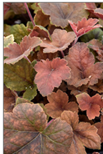
Pumpkin Spice Foamy Bells foliage

Pumpkin Spice Foamy Bells is recommended for the following landscape applications;