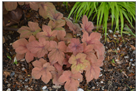
Pumpkin Spice Foamy Bells