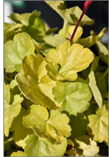
Dolce Appletini Coral Bells foliage

Dolce Appletini Coral Bells will grow to be about 10 inches tall at maturity extending to 20 inches tall with the flowers, with a spread of 24 inches. When grown in masses or used as a bedding plant, individual plants should be spaced approximately 18 inches apart. Its foliage tends to remain low and dense right to the ground. It grows at a medium rate, and under ideal conditions can be expected to live for approximately 10 years. As an evergreen perennial, this plant will typically keep its form and foliage year-round.