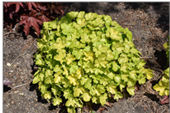
Dolce Appletini Coral Bells