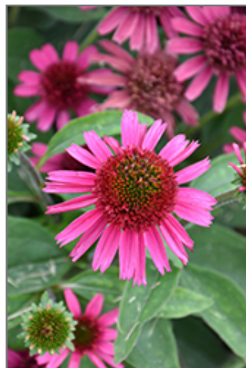
Delicious Candy Coneflower flowers

This is a relatively low maintenance plant, and is best cleaned up in early spring before it resumes active growth for the season. It is a good choice for attracting butterflies to your yard, but is not particularly attractive to deer who tend to leave it alone in favor of tastier treats. It has no significant negative characteristics.