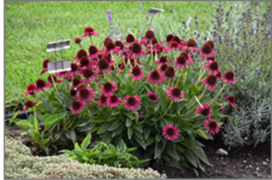
Delicious Candy Coneflower in bloom

Delicious Candy Coneflower will grow to be about 18 inches tall at maturity extending to 24 inches tall with the flowers, with a spread of 15 inches. It grows at a medium rate, and under ideal conditions can be expected to live for approximately 10 years. As an herbaceous perennial, this plant will usually die back to the crown each winter, and will regrow from the base each spring. Be careful not to disturb the crown in late winter when it may not be readily seen!