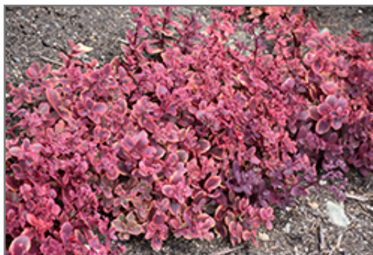
Sunsparkler Wildfire Stonecrop