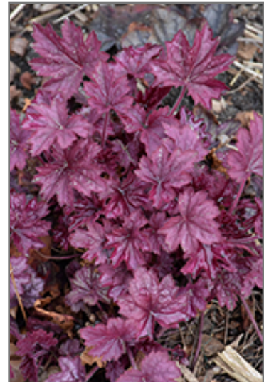
Wild Rose Coral Bells foliage