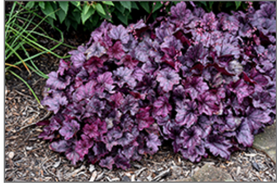
Wild Rose Coral Bells

This is a relatively low maintenance plant, and should be cut back in late fall in preparation for winter. It is a good choice for attracting hummingbirds to your yard. It has no significant negative characteristics.