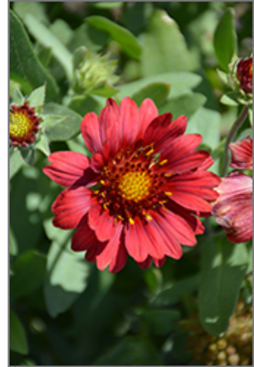
Mesa Red Blanket Flower flowers

Mesa Red Blanket Flower is recommended for the following landscape applications;