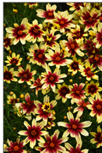
Satin & Lace Red Chiffon Tickseed flowers