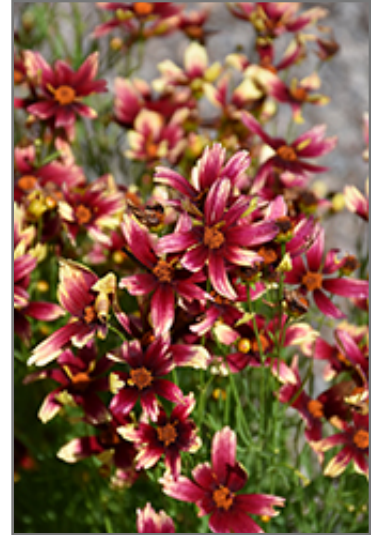
Satin & Lace Red Chiffon Tickseed flowers

Satin & Lace Red Chiffon Tickseed is a fine choice for the garden, but it is also a good selection for planting in outdoor pots and containers. It is often used as a 'filler' in the 'spiller-thriller-filler' container combination, providing a mass of flowers against which the thriller plants stand out. Note that when growing plants in outdoor containers and baskets, they may require more frequent waterings than they would in the yard or garden. Be aware that in our climate, most plants cannot be expected to survive the winter if left in containers outdoors, and this plant is no exception. Contact our experts for more information on how to protect it over the winter months.