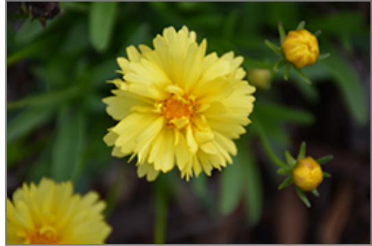
Leading Lady Charlize Tickseed flowers

Leading Lady Charlize Tickseed is recommended for the following landscape applications;