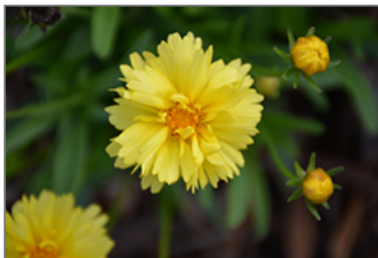
Leading Lady Charlize Tickseed flowers

Leading Lady Charlize Tickseed is recommended for the following landscape applications;