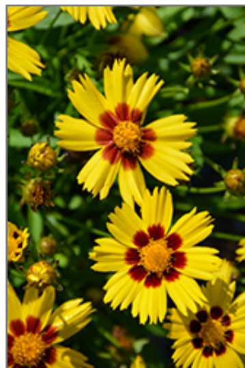
Sunkiss Tickseed flowers