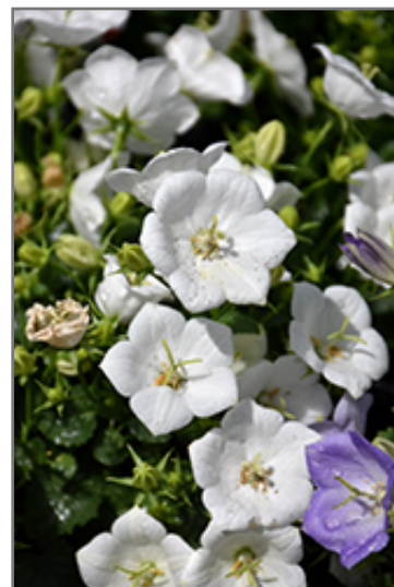
Rapido White Bellflower flowers