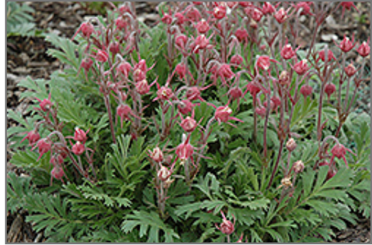
Prairie Smoke in bloom

Prairie Smoke is an herbaceous perennial with an upright spreading habit of growth. Its relatively fine texture sets it apart from other garden plants with less refined foliage.