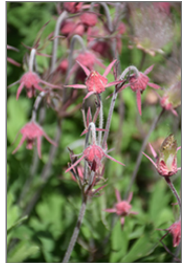
Prairie Smoke flower buds