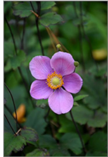
Lucky Charm Anemone flowers