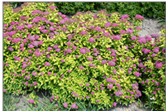
Double Play Gold Spirea in bloom