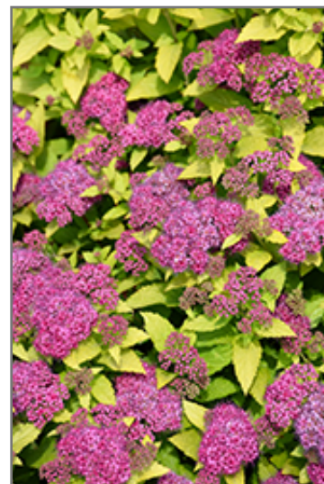
Double Play Gold Spirea flowers

This shrub will require occasional maintenance and upkeep, and is best pruned in late winter once the threat of extreme cold has passed. It is a good choice for attracting butterflies to your yard, but is not particularly attractive to deer who tend to leave it alone in favor of tastier treats. It has no significant negative characteristics.