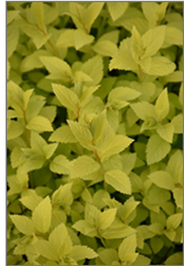
Double Play Gold Spirea foliage

This shrub should only be grown in full sunlight. It prefers to grow in average to moist conditions, and shouldn't be allowed to dry out. It is not particular as to soil type or pH. It is highly tolerant of urban pollution and will even thrive in inner city environments. This is a selected variety of a species not originally from North America.