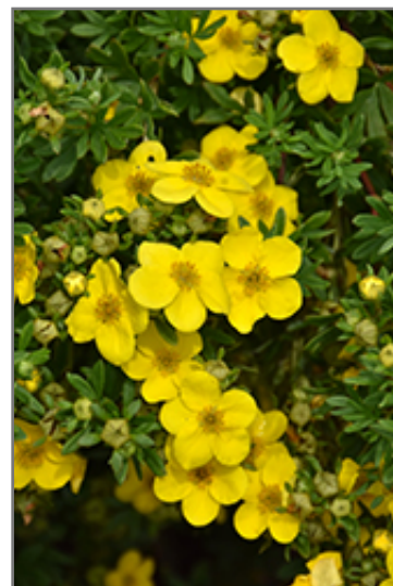
Happy Face Yellow Potentilla flowers

Happy Face Yellow Potentilla is recommended for the following landscape applications;